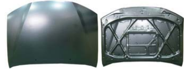
9 HOOD W/O INTER COOLER