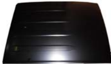
10 ROOF DOUBLE CAB