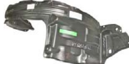
11 INNER FENDER W/O IRON 2WD