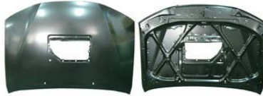
8 HOOD W/ TURBO HOLE