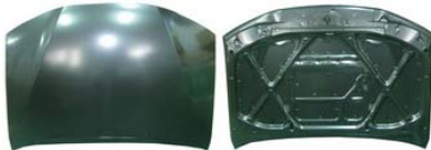
7 HOOD W/O TURBO HOLE