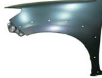
5 FENDER 4WD W/ F.F HOLE & W/O S.L HOL