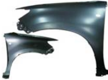
4 FENDER 2WD W/ S.L HOLE