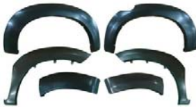
13 FENDER FLARE SETS 6 PCS OEM TYPE