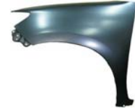
6 FENDER 2WD W/O S.L HOLE