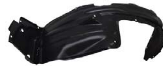
12 INNER FENDER W/ METAL 4WD